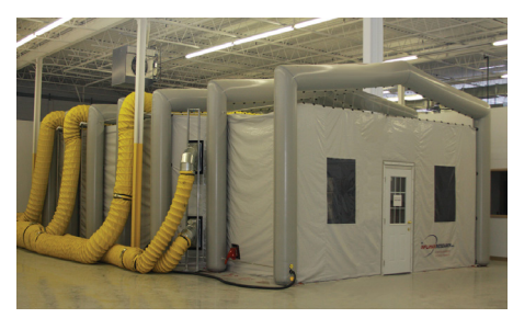
Our mobile EEC technology (mEEC™)